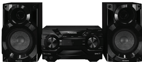
MINI HI FI'S