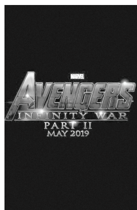
100S OF PASSES TO SEE MARVELS "AVENGERS 4 - INFINITY"

**Entry must be typed and on A4 Paper. Entries will be judged on quality, meaning and creativity. Please ensure the name grade and class are clearly included on both your story and on the official ANZAC Day Initiatives entry form.