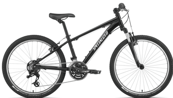
BIKE AND HELMET